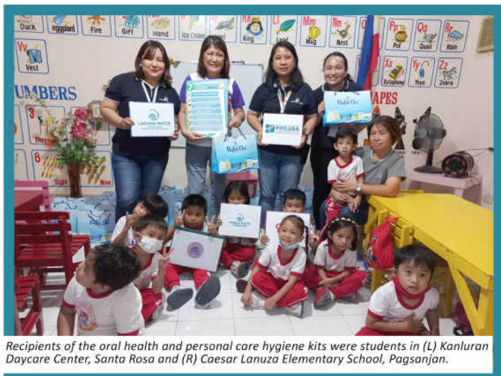
Recipients of the oral health and personal care hygiene kits were students in (L) Kanluran Daycare Center, Santa Rosa and (R) Caesar Lanuza Elementary School, Pagsanjan.

The students of Caesar Z. Lanuza Elementary School in Pagsanjan and Brgy. Kanluran Child Development and Health Centers in Santa Rosa City received oral health and personal care hygiene kits, including a toothbrush, dental floss, isopropyl alcohol, and foaming hand soap.